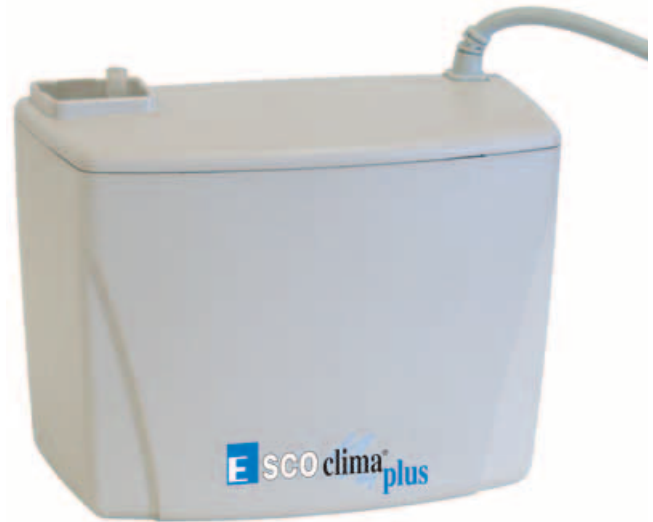
AS 06 803

Noise Reduction System (patent-pending): Recognising that noise is a concern to users, a unique vibration-suction suspension system is designed to further reduce the motor noise level.