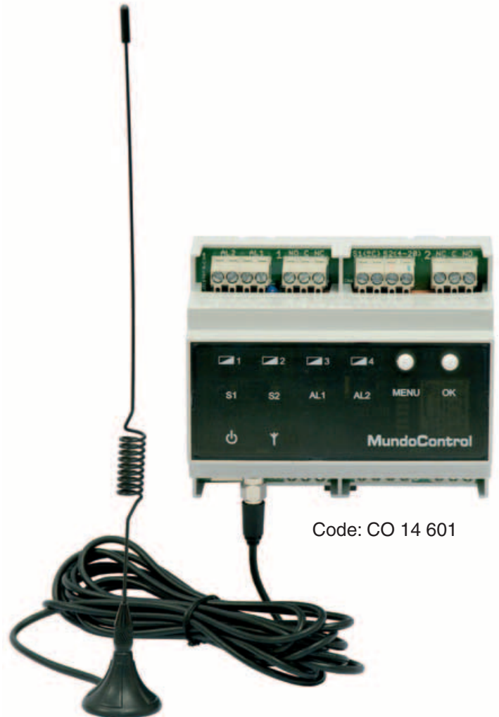
Code: CO 14 601