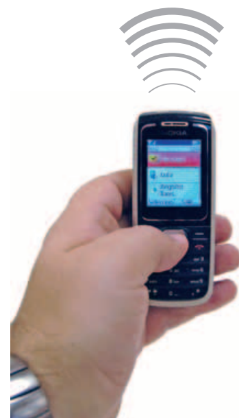
Control your DOMO-GSM by sending a simple text message