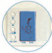
LCD display with % RH indicator and electronic hygrosat.